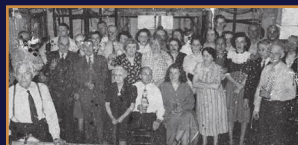
Candlemas celebration, early 1940s