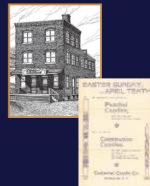
The first Easter brochure, 1898

The Baumer company diversifies outside the liturgical candle market. Staying true to his desire to make candles purely for religious purposes, Jacob founds the Cathedral Candle Company at 510 Kirkpatrick Street in Syracuse. The factory's first building—still the heart of our current facility—is built in Jacob's backyard.